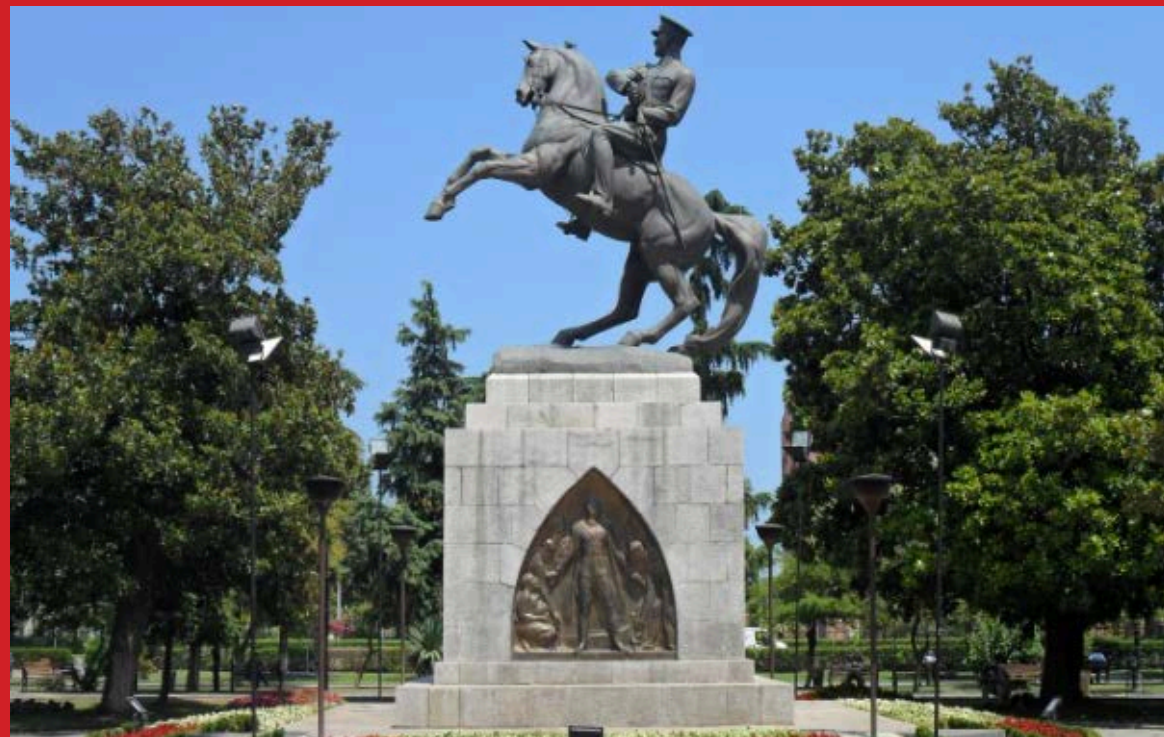
The father of modern Turkey "ATATURK " in Samsun