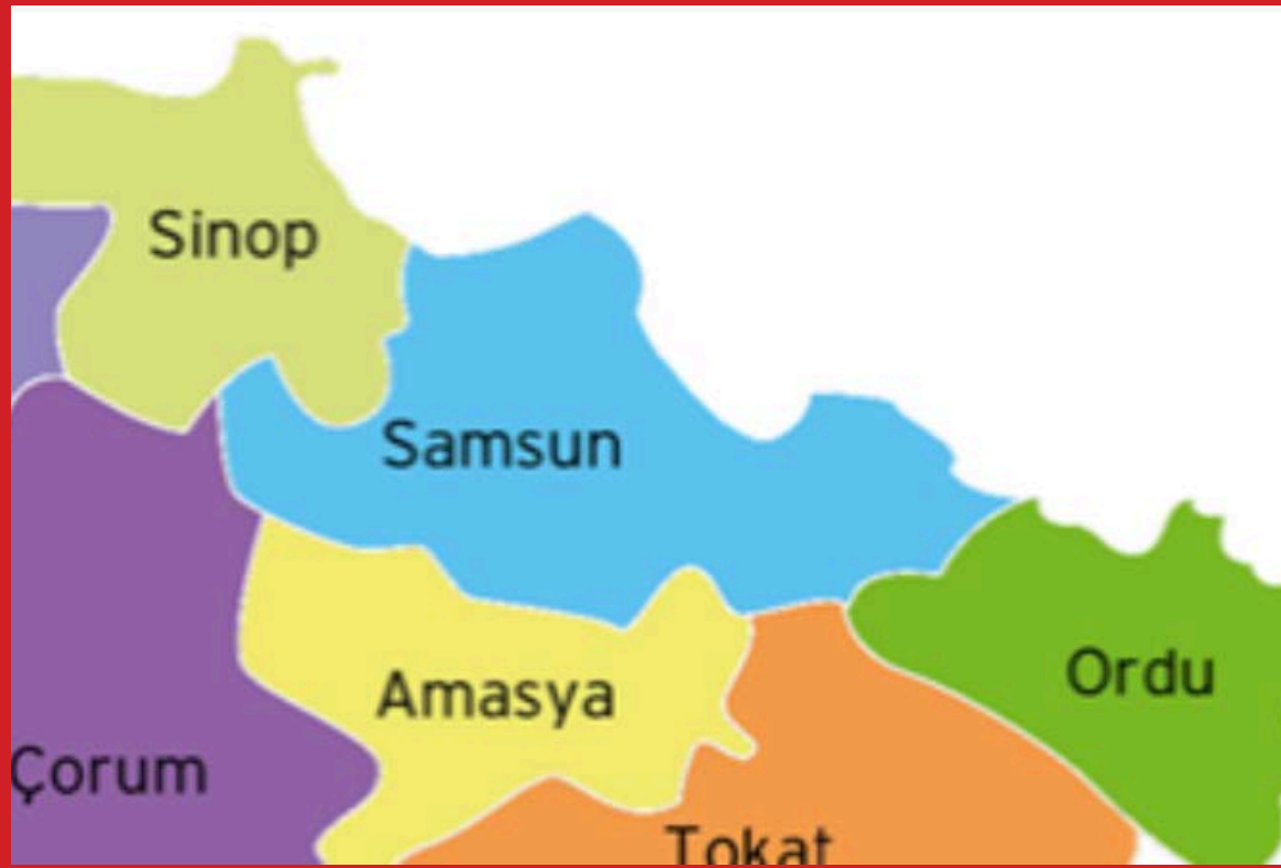
The map of central Black Sea Region