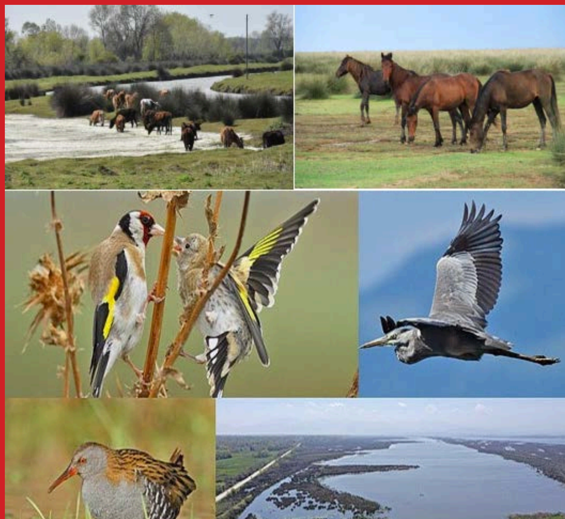
THE BIRD PARADISE OF KIZILIRMAK in SAMSUN