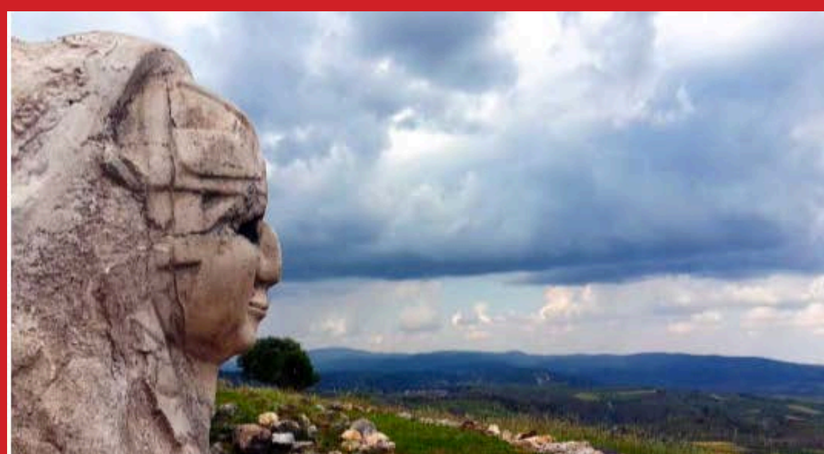
THE HITTITES EMPIRE , BRONZE AGE, BC. 1400-1500