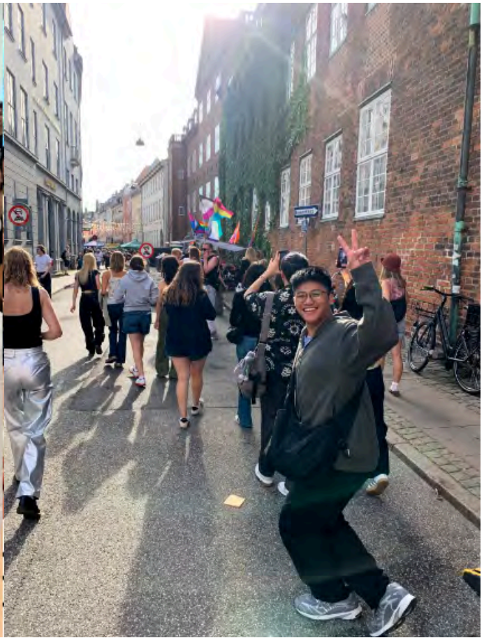
Camp Copenhagen 2025