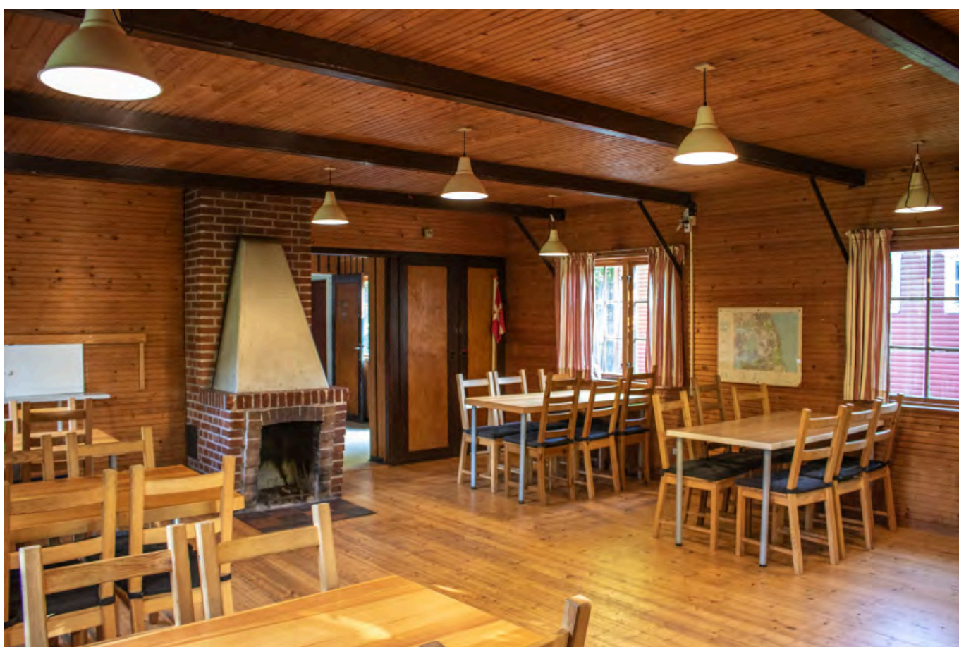
Hellerud scout cottage, Søterrassen 17, 2840 Holte, Denmark