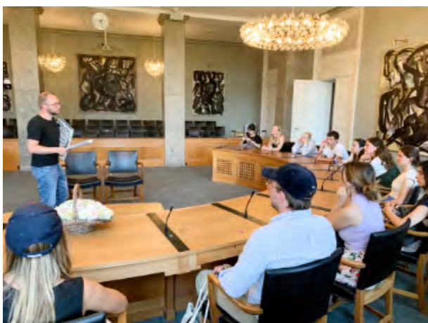
Camp Copenhagen 2025